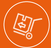
Logistics & Industrial