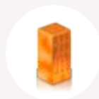
OPERATION & MAINTENANCE